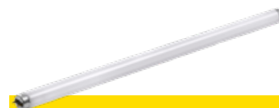
Fly-Tec-60 Shatterproof Lamp 15W H812202